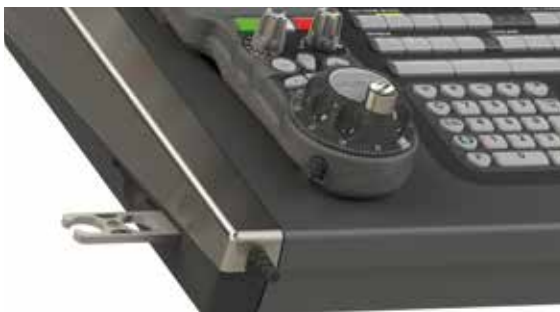
Optional Flip-Out Hook